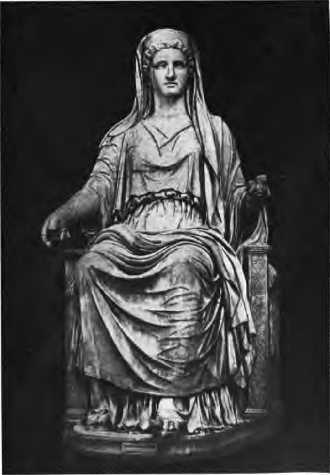
Fig. 43. Demeter.